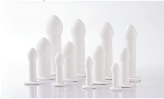
Vaginal Dilator Sets

Model: Family A -Large, Family B -Medium, Family C-Small